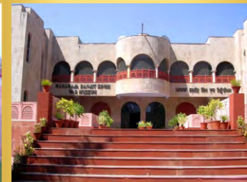
Maharaja Ranjit Singh Museum